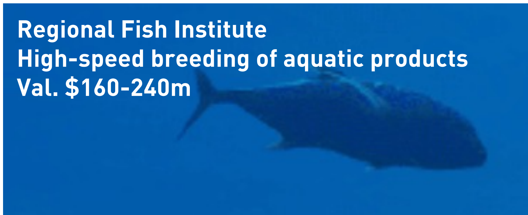
Regional Fish Institute High-speed breeding of aquatic products Val. $160-240m