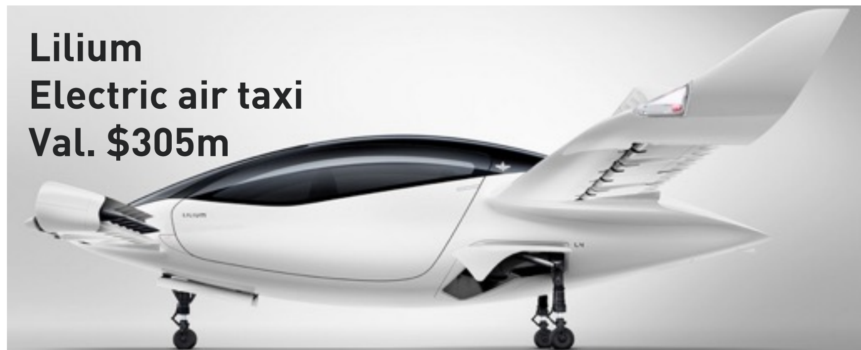
Lilium Electric air taxi Val. $305m