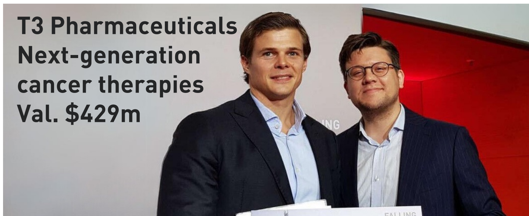
T3 Pharmaceuticals Next-generation cancer therapies Val. $429m