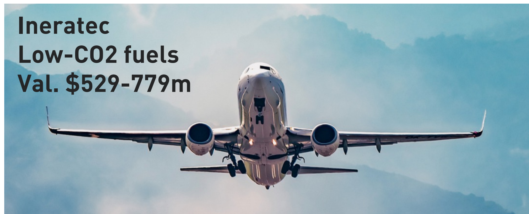
Ineratec Low-CO2 fuels Val. $529-779m