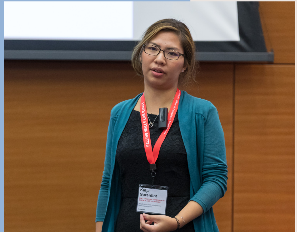
FALLING WALLS LAB KAUST Keychain