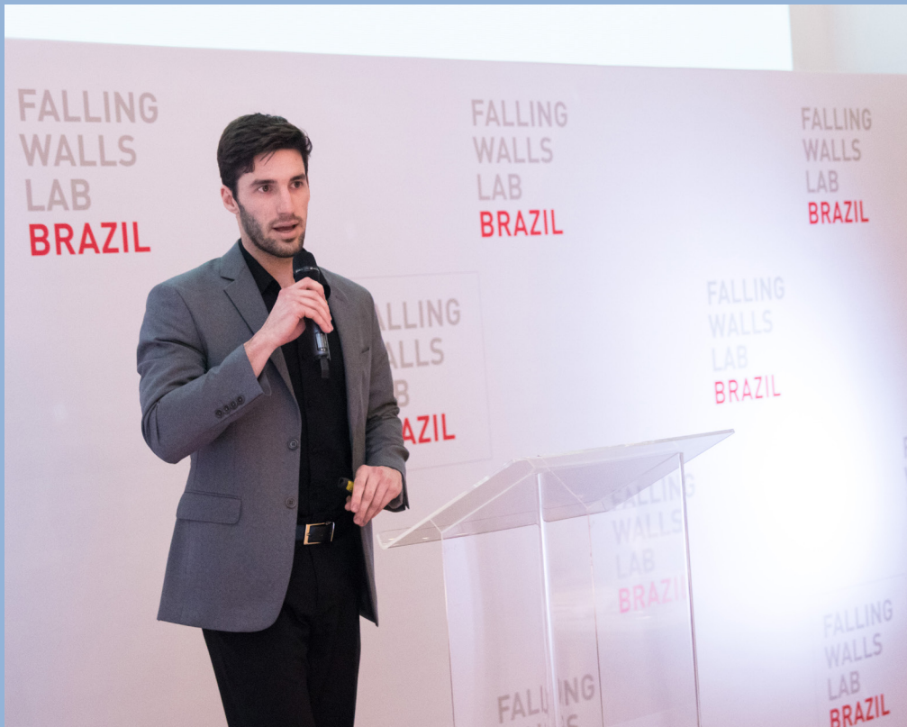
FALLING WALLS LAB BRAZIL Backdrop