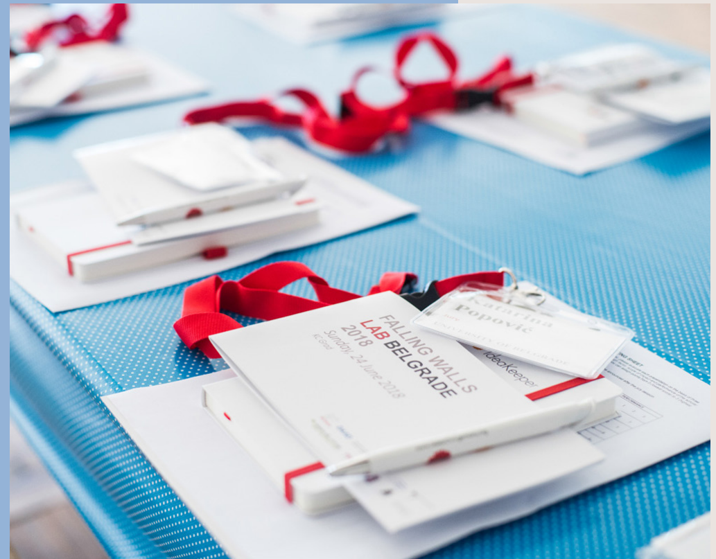
FALLING WALLS LAB BELGRADE Jury Table