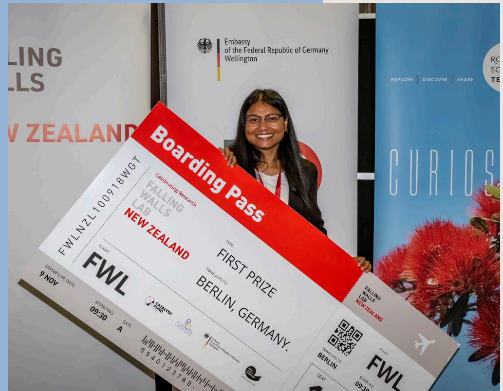
FALLING WALLS LAB NEW ZEALAND Boarding Pass