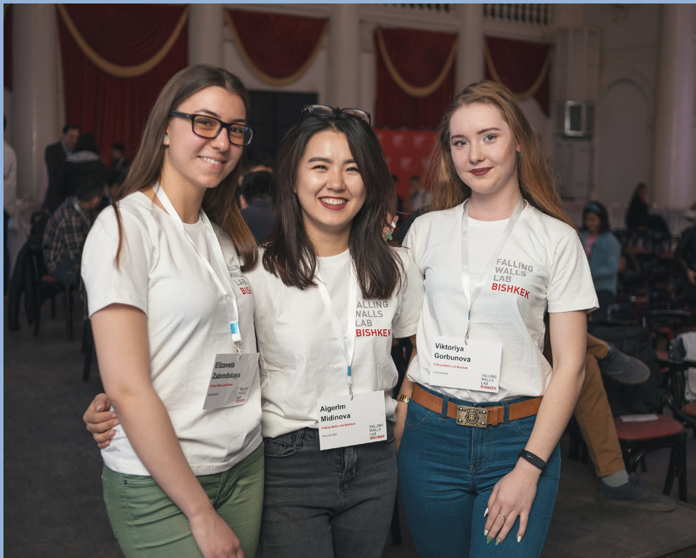
FALLING WALLS LAB BISHKEK T-Shirts