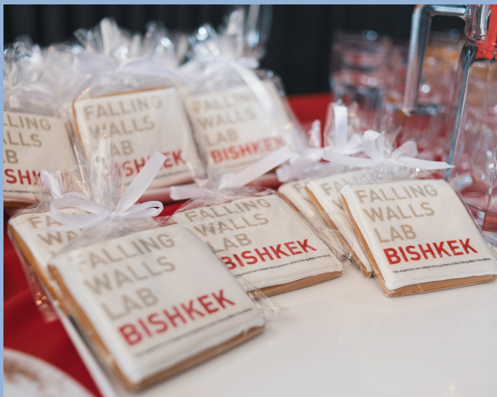
FALLING WALLS LAB BISHKEK Cookies