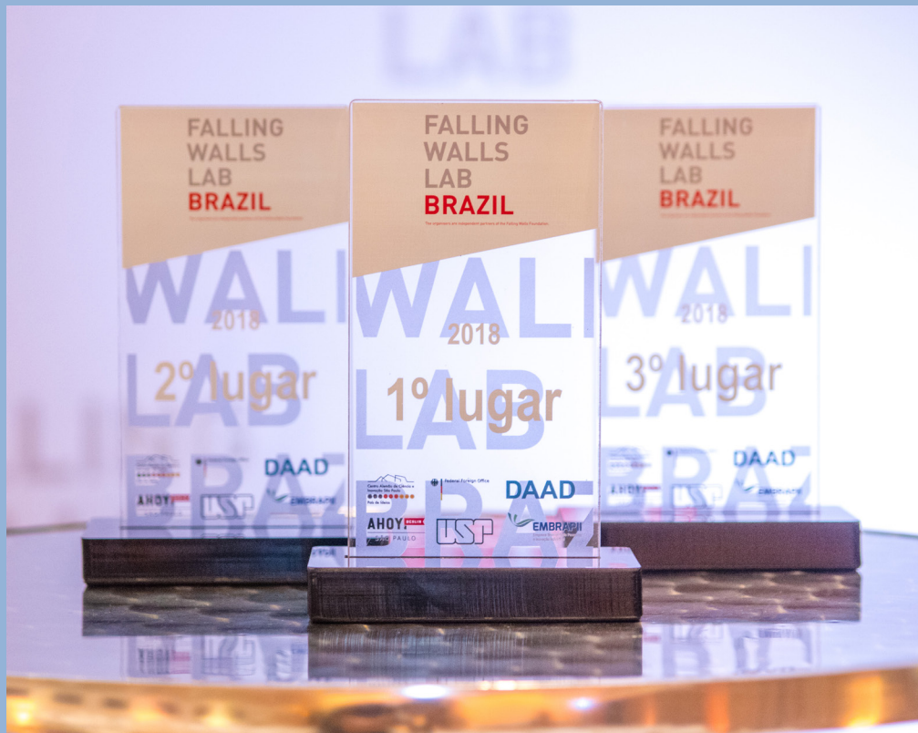
FALLING WALLS LAB BRAZIL Awards

Unlock the full potential of your event with creative branding that leaves a lasting impression on your participants. Whether your budget is big or small, there are numerous opportunities to elevate your Lab's visual appeal and make it truly unforgettable. Explore some inspiring branding initiatives from past Labs below!